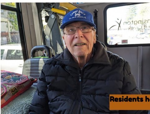
Residents had so much fun on our scenic drive to Crow Canyon