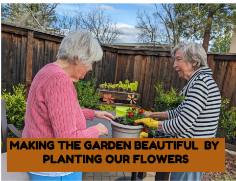
MAKING THE GARDEN BEAUTIFUL BY PLANTING OUR FLOWERS