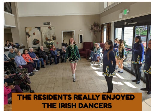
THE RESIDENTS REALLY ENJOYED THE IRISH DANCERS