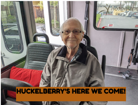
HUCKELBERRY'S HERE WE COME!