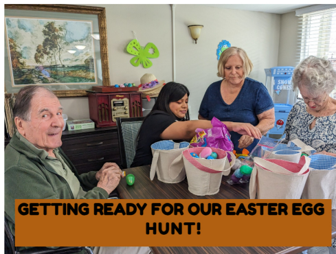
GETTING READY FOR OUR EASTER EGG HUNT!